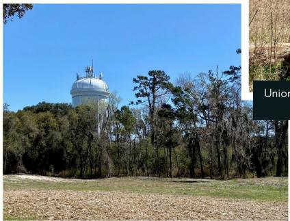
Union Cemetery Water Tower, Hilton Head Island

Can you guess how much water this tower holds?