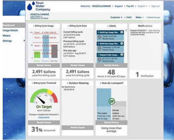
Water Usage Portal

□ The Water Usage Portal is especially useful for landlords or second home owners, allowing you to keep an eye on your property here in Hilton Head while you are away. Set up text or phone alerts to signal you if your water usage exceeds a level you determine.