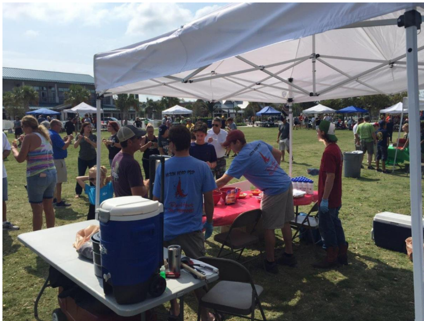
Hilton Head PSD crew at the 2017 Chili Cook-Off.

Join Hilton Head PSD at the Kiwanis Club of Hilton Head's 35th Annual Chili Cook-Off