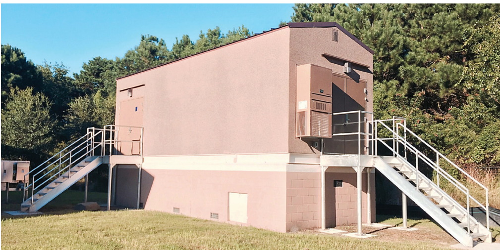
The PSD recently completed construction of this water booster pump station at our Reverse Osmosis Water Treatment Facility on Jenkins Island. The station aids in the distribution of water and is part of the utility's overall effort to replace water supply lost as a result of saltwater intrusion into the fresh water Upper Floridan Aquifer.

Property owners receiving immediate access will be notified by the PSD when the system is ready for their connection. The PSD provides long-term, low-interest financing for all connection costs for all customers. Customers who meet income qualifications can receive connection assistance through Project SAFE (Sewer Access For Everyone), a charitable fund of the Community Foundation of the Lowcountry.