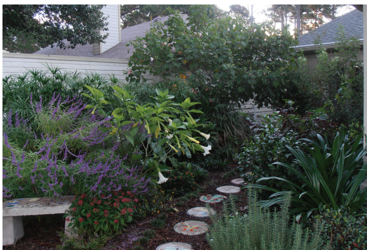
Betty Manne's rain garden inside Hilton Head Plantation. Manne, a Clemson Master Gardener, planted the rain garden as a beautification and water-efficiency project.

The rain garden is just two years old, but the pictures indicate a more mature setting. As the plants were being put in the ground I mixed compost with the soil. After planting I used Quick Start on all the plants to give them a good start.